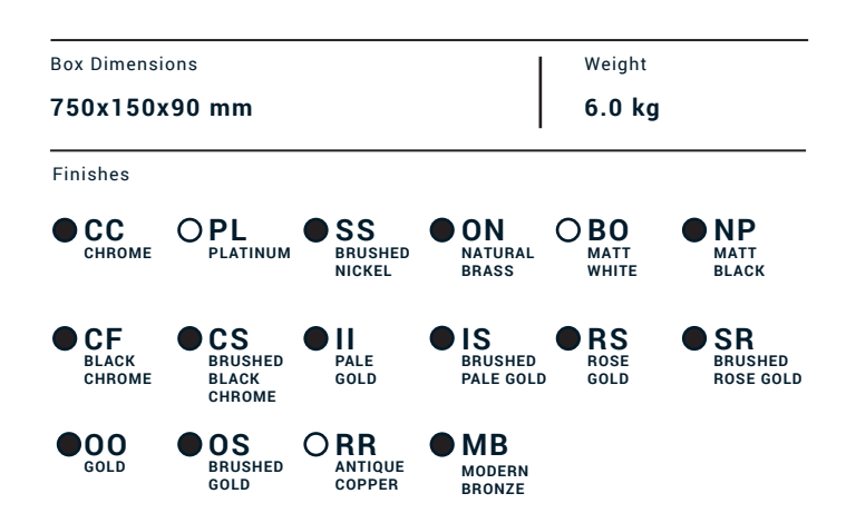
Plate and handles trimkit