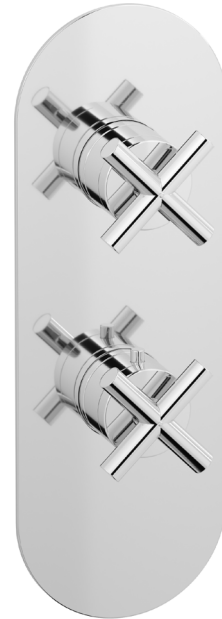
Plate and handles trimkit