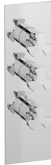
Plate and handles trimkit.