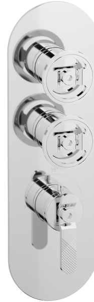
Plate and handles trimkit