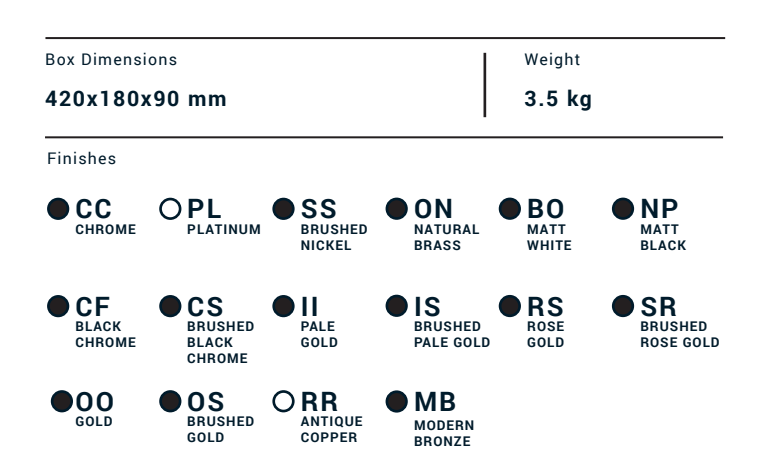
Plate and handles trimkit