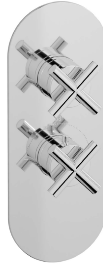
Plate and handles trimkit