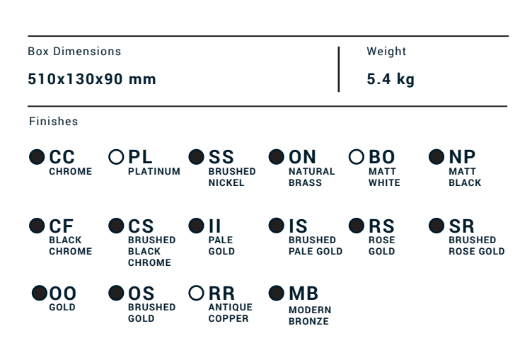
Plate and handles trimkit