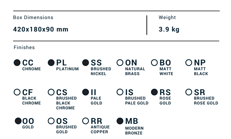
Plate and handles trimkit.