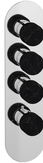
Plate and handles trimkit