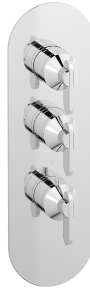
Plate and handles trimkit