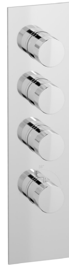
Plate and handles trimkit