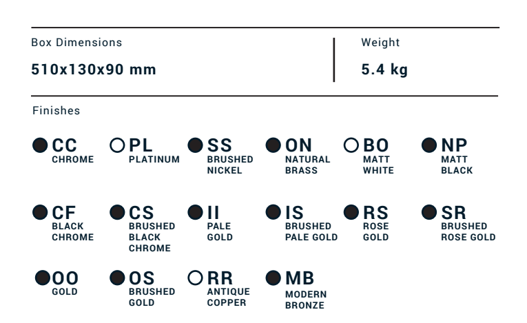
Plate and handles trimkit