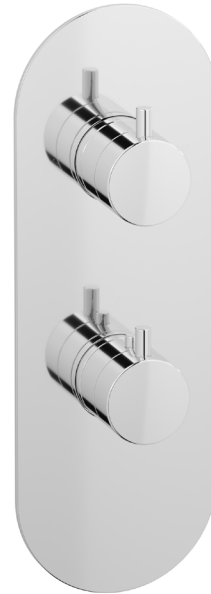
Plate and handles trimkit